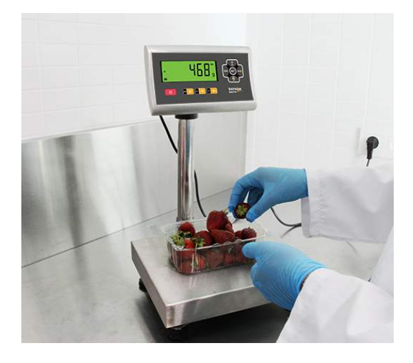
Individual net or gross packaging on the scale