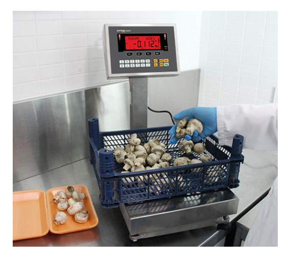
Packing by taking away from the full case on the scale

This method is used to fill the products into the packages in the case on the scale. The operator fills packages in sequence by following only the color of the display, which increases the efficiency of the operator and the productivity of the system. Taring, Data transfer etc. are done automatically in process to increase the production line speed besides the fast speed of the scale.