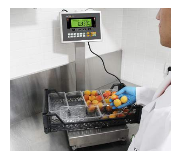
Filling the packages in the big case on the scale

This method is used to pack products one by one on the scale. The operator only follows the color of the screen during the process, which increases the efficiency of the operator and the system. With automatic zeroing, automatic taring, automatic data transfer, automatic labeling, etc. functions, the speed of the packaging line is increased.